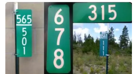
Reflective Address Signs

Go to bewildfireready.org to order one today!