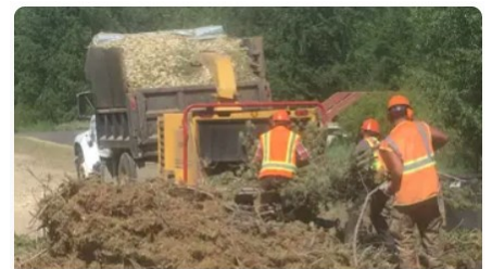
Community Chipping Days