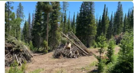
Fuels Reduction Cost-Share Program